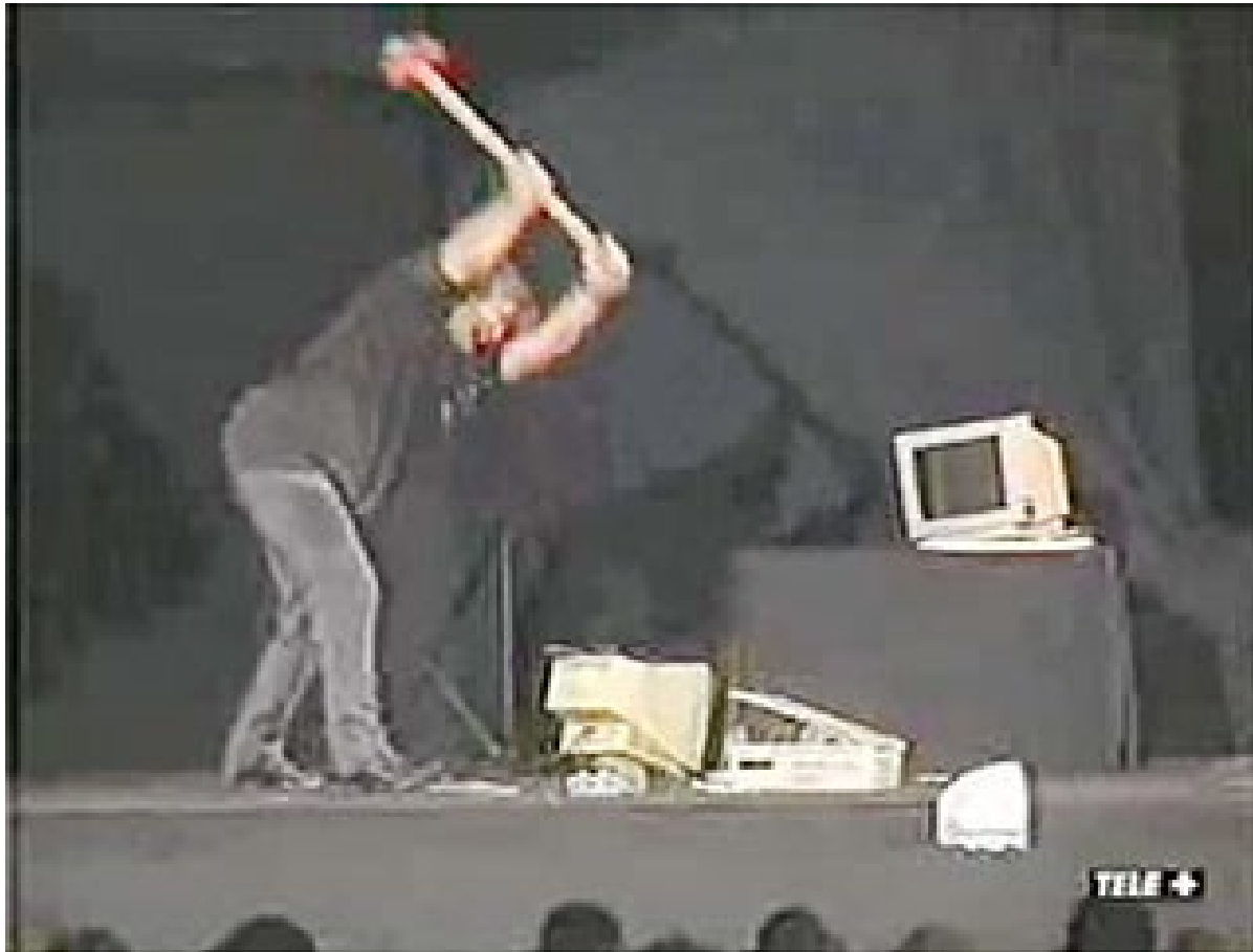
Beppe Grillo, Tutto il Grillo che conta , 2000.