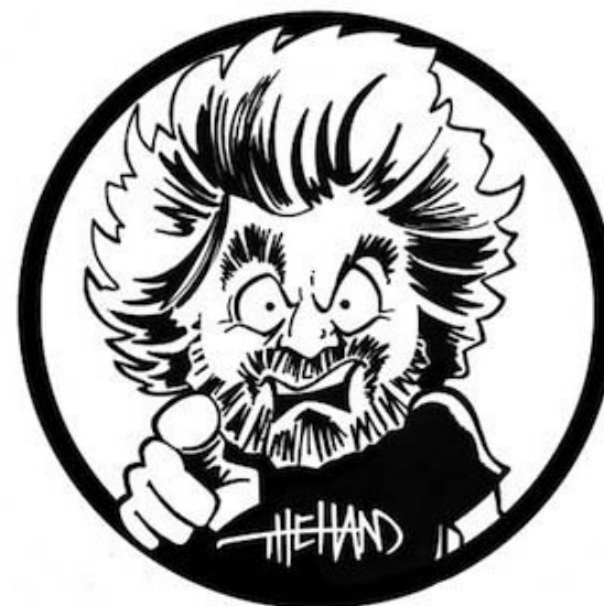
The Hand (Maurizio Di Bona), Beppe Grillo (cartoon).