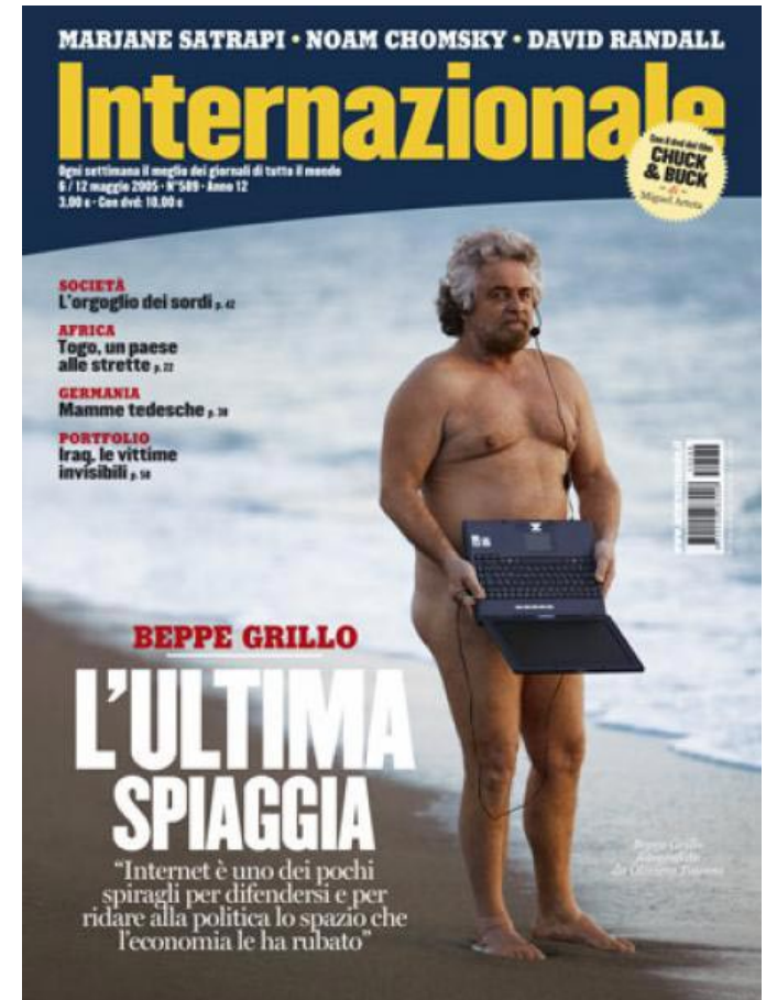
“Internazionale” (cover), May 12, 2005.