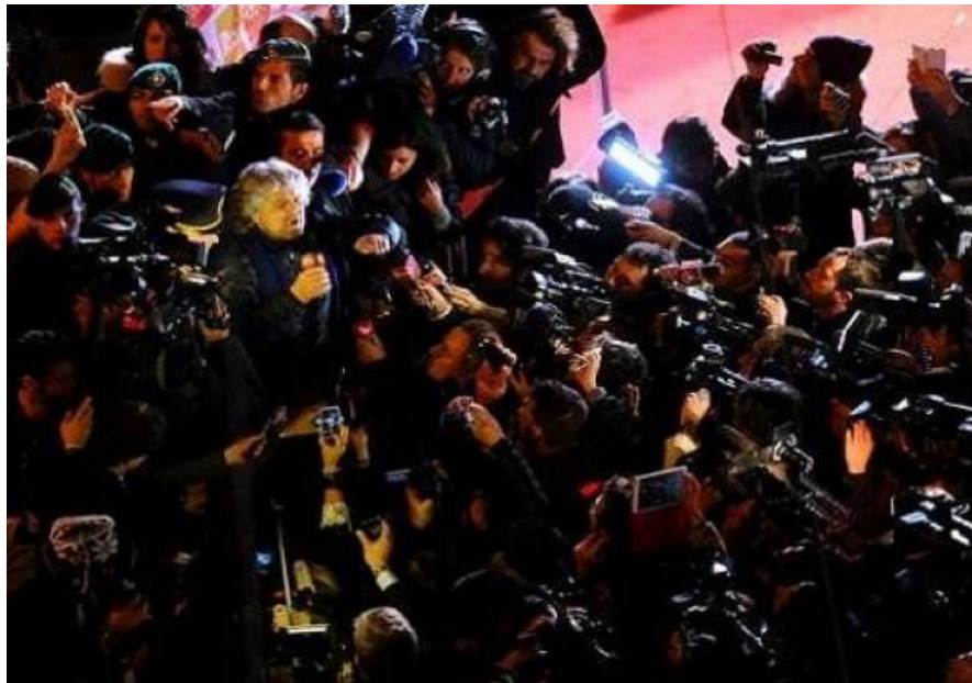
Beppe Grillo outside Teatro Ariston, Sanremo Festival, February, 2013.