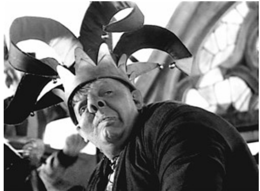
Charles Laughton as King of Fools ( The Hunchback of Notre Dame , 1939).