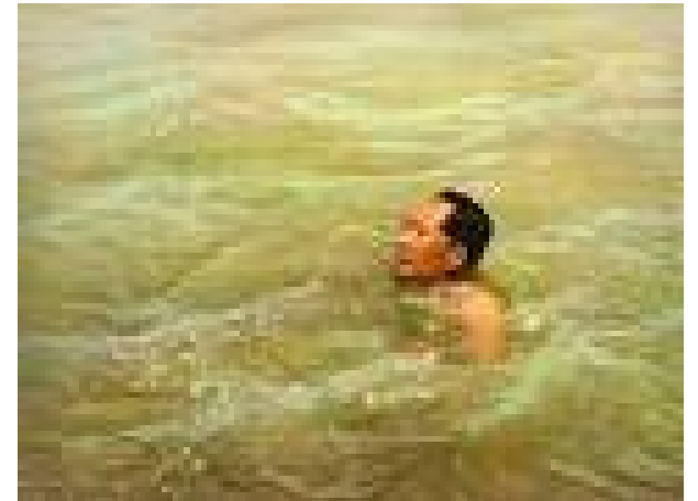
Mao Zedong, 1966.