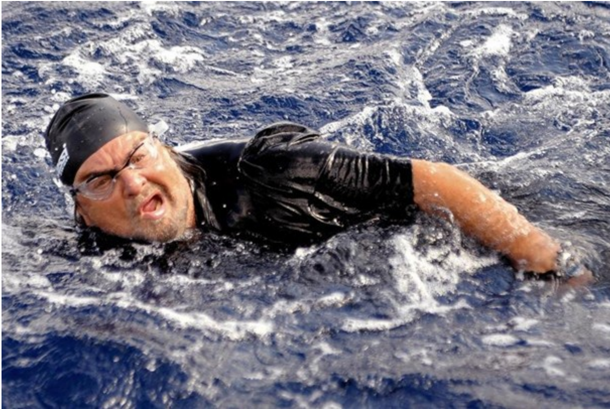
Beppe Grillo, 2012.

Other political swimmers were Benito Mussolini and Mao Zedong, with the famous raid on the Yangtze River in 1966.